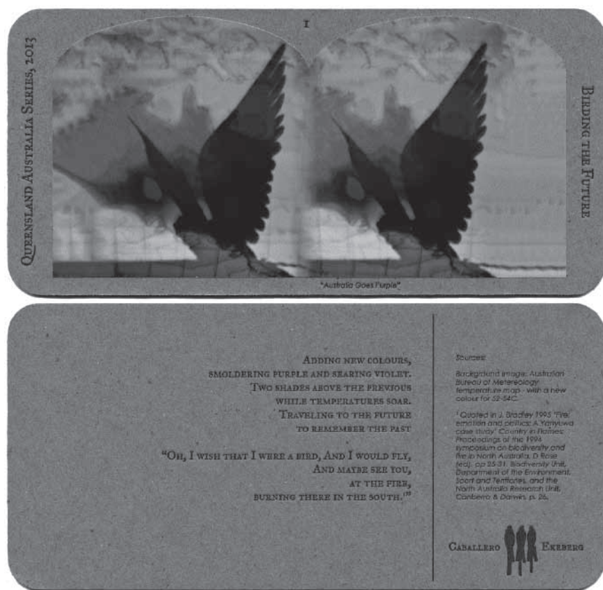
Fig. 2. Birding the Future: Australia Goes Purple (2013). © Krista Caballero.)

to the function of technology in the soundscape, the stereoscope becomes the visual tool to see what is now extinct.